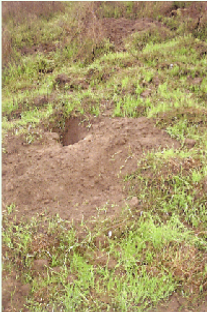
Badger burrow, Paula Lane land

The planned Paula Lane Open Space Preserve is designed to protect and preserve the exceptional upland habitat area and wildlife movement corridor in West Petaluma, California.