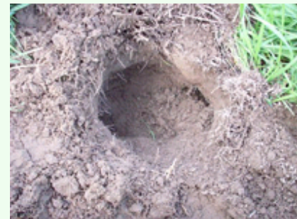
Badger burrow, Paula Lane land

A popular Petaluma Rotary Club walk is the loop between Oak Hill Park on the west side out to Paula Lane, through Cherry Valley, and back to Oak Hill Park.